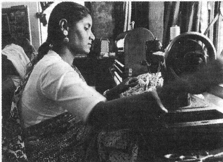
Mahila Samity photos